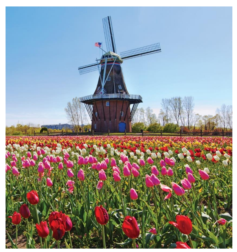
9 Days • 13 Meals: 8 Breakfasts, 1 Lunch, 4 Dinners

HIGHLIGHTS... Chicago, Millenium Park, Holland's Tulip Time Festival, Mackinac Island, Grand Hotel, Frankenmuth, Henry Ford Museum & Greenfield Village