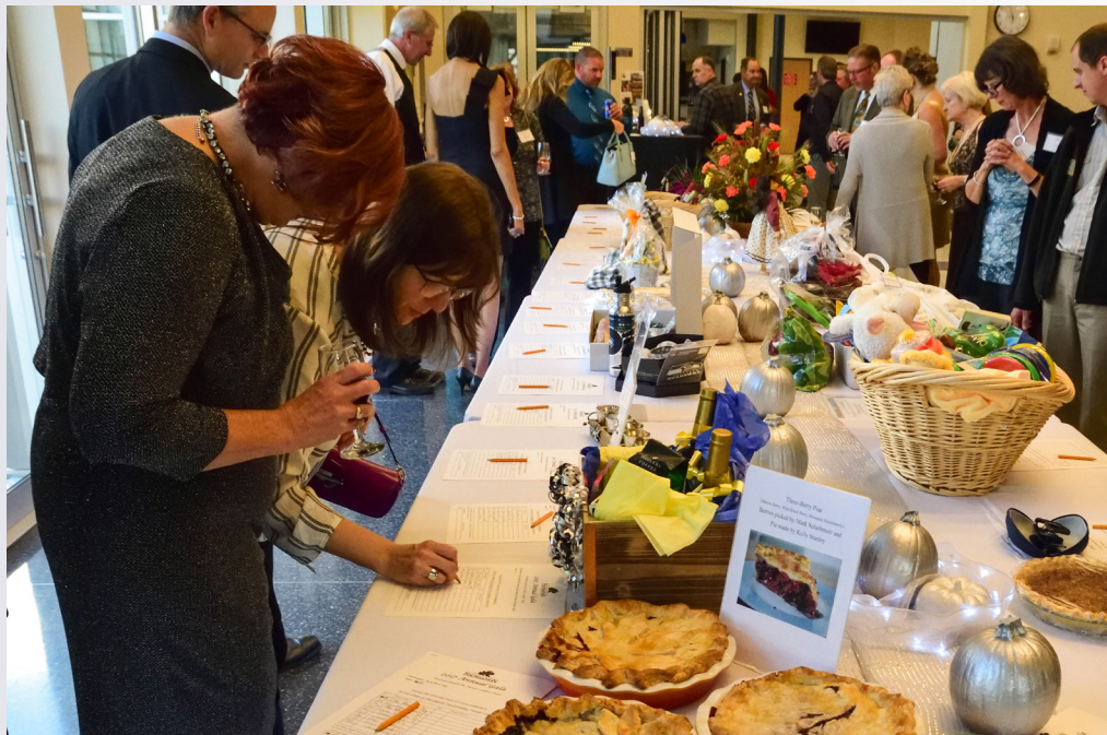
Guests enjoyed a social hour with a silent auction before the start of the formal program.