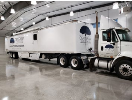
A mobile classroom promoting trades education will be ready to visit local high schools this fall.

If you are interested in a tour of the facility, contact the foundation office at foundation@centralia.edu and we will add you to a list as time is available.