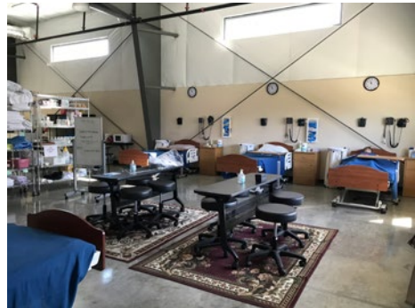
The Arbor Health Education Center in the SWFT Center is ready for healthcare training for students and community courses.